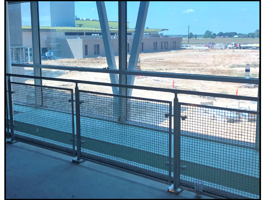
2nd Floor Guardrails