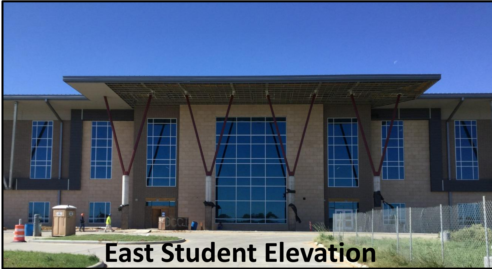
East Student Elevation